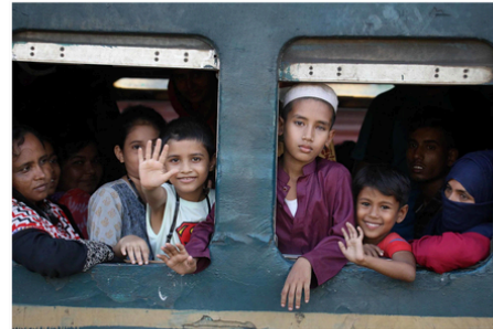
Vor dem Eid-Adha-Feiertag, einem der wichtigsten muslimischen Feste, drängen sich Menschen am Bahnhof von Dhaka, Bangladesch, um sich auf den Weg in ihre Heimatdörfer zu machen.